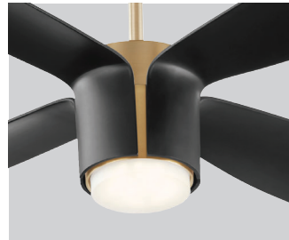
-4015 Aged Brass& black

SPECIFICATIONS 4 Blades / 60" Blade Sweep / 21° Blade-Pitch 4" and 6" downrod (Included) Optional downrods available for high ceilings 6 Speeds - Reversible; 0.40A on high / 0.06A on low 33W on high / 4W on low 114 rpm on high / 51 rpm on low Wall control (Included) Remote control 3-8-2001-0 (Optional)